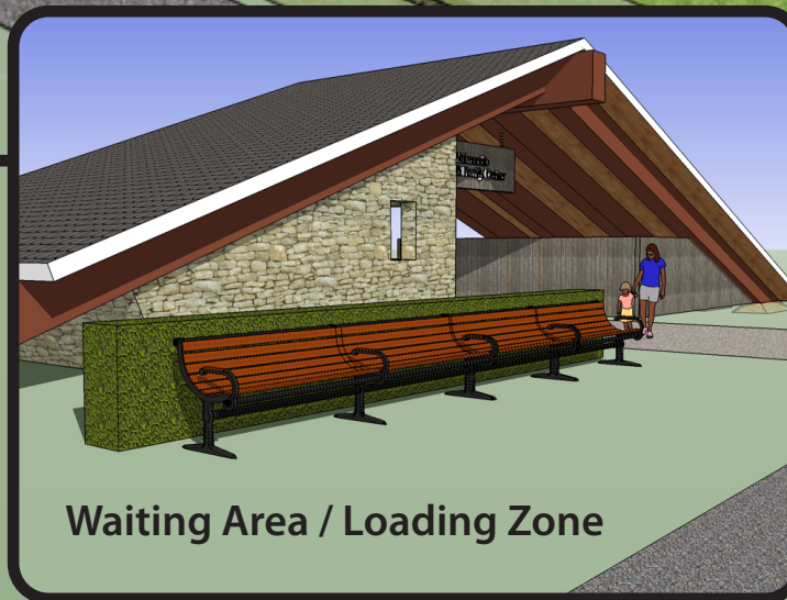
Waiting Area / Loading Zone